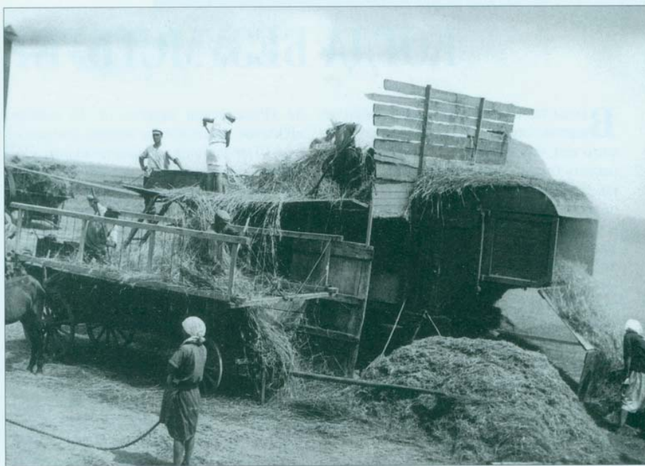
Молотьба на колхозном поле. Днепропетровская область. 1933 г. РГАКФД.